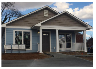
589 and 581 Vernon St.

The second home, 581 Vernon Street, is Habitat for Humanity's first four bedroom home. Flooring has been installed and landscaping will be underway soon. Both homes will be completed by the end of March.