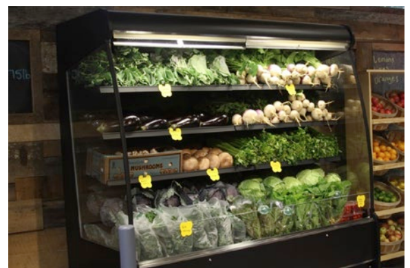
Fresh produce in Monarch Café