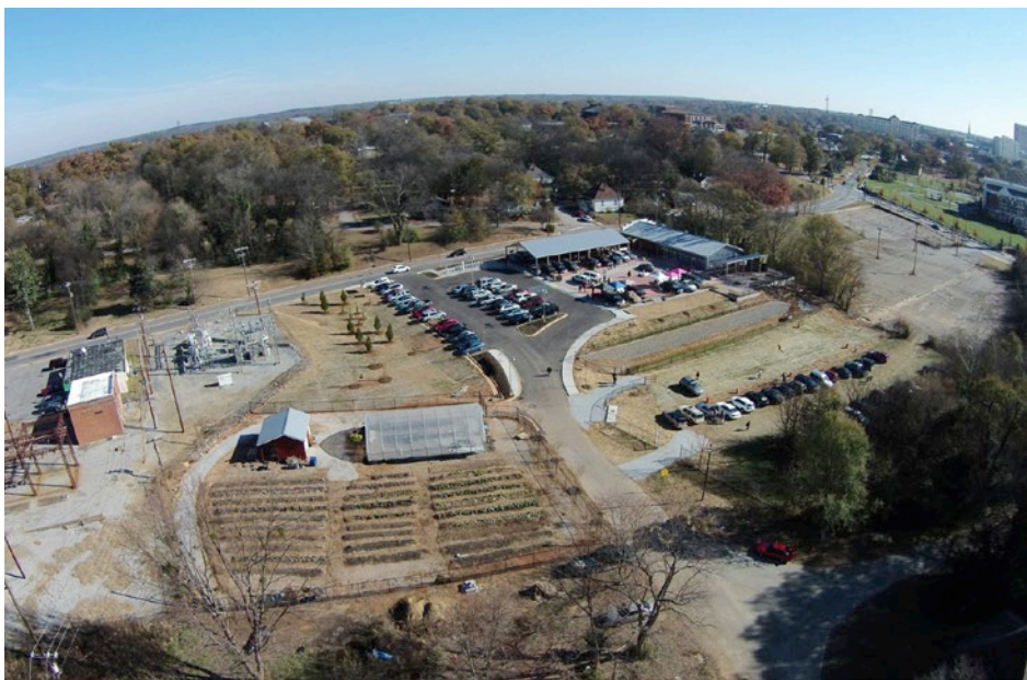
An aerial view of the Northside's Harvest Park.