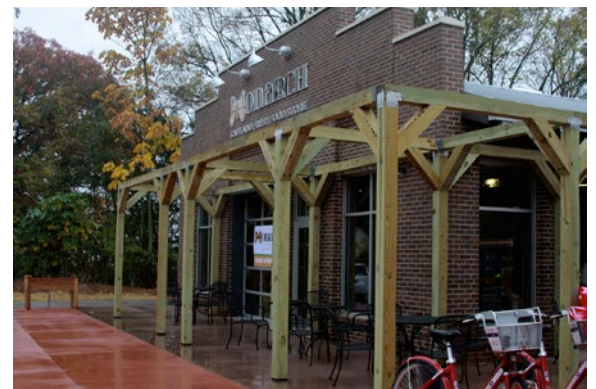
Monarch Café and Fresh Food Store